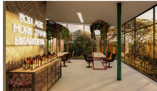
Selfcare Studio at Brazil, Lina Bo Bardi's house