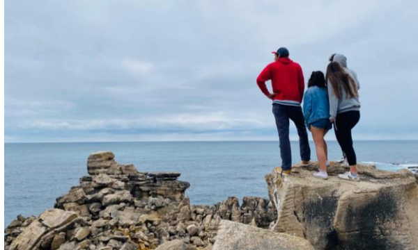
Peniche, Centro, Portugal