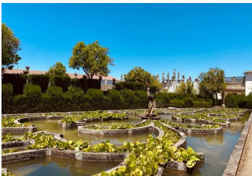
Jardim do Paço Episcopal, Castelo Branco, Portugal