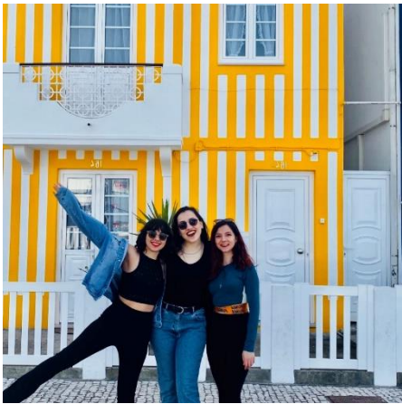
Aveiro, Baixo Vouga, Portugal