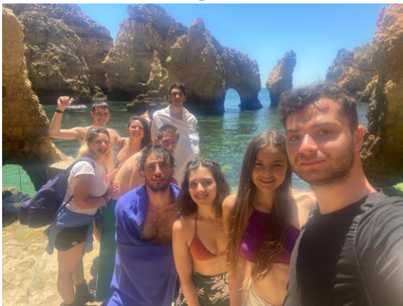
Ponta da Piedade, Lagos, Portugal