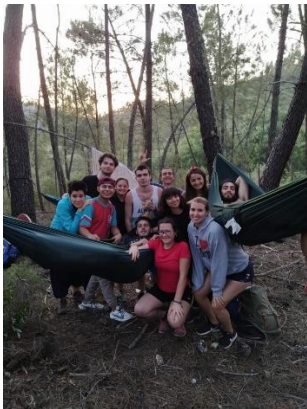
Castelo Branco, Portugal