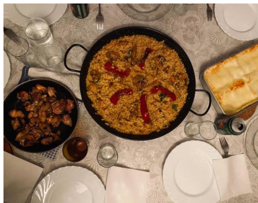
Castelo Branco, Portugal