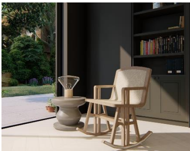
Furniture Design inspired by Portugal