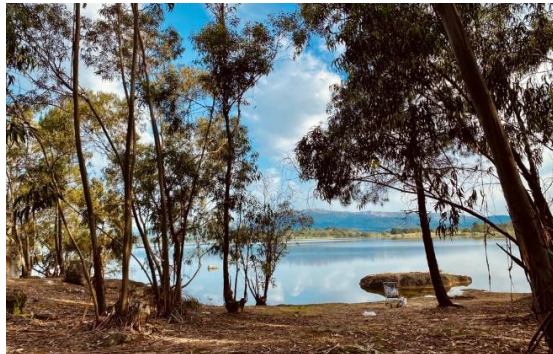
Ribeira da Ocreza, Castelo Branco, Portugal