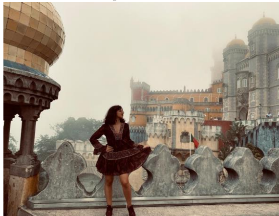
Sintra, Lisbon, Portugal