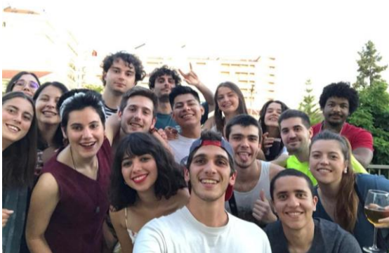
Castelo Branco, Portugal