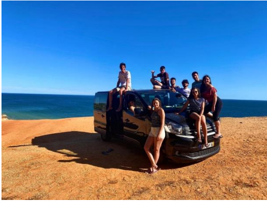
Albufeira, Algarve, Portugal