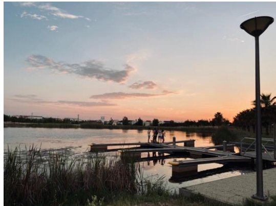
Castelo Branco, Portugal