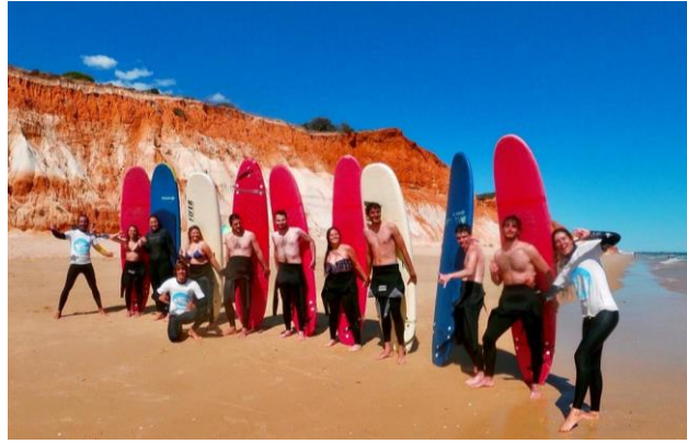
Albufeira, Algarve, Portugal