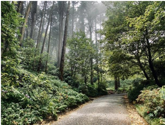
Sintra, Lisbon, Portugal