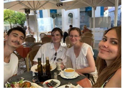
Lagos, Algarve, Portugal