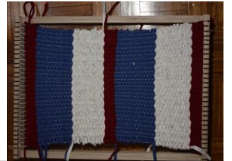
Some of my works in my semester in Portugal