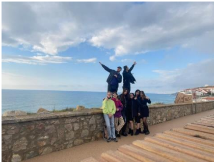
Azenhos Do Mar